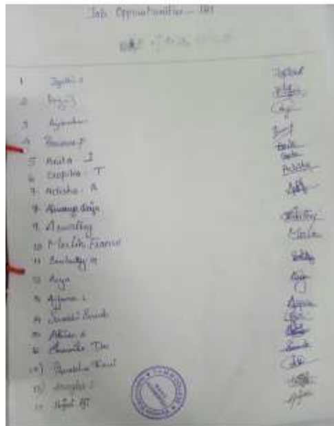
Career Guidance session by IBS team

Nangiarkulangara, Kerala, India 7F78+J63, Nangiarkulangara, Kerala 690513, India Lat 9.264216° Long 76.465351° 02/03/22 10:19 AM