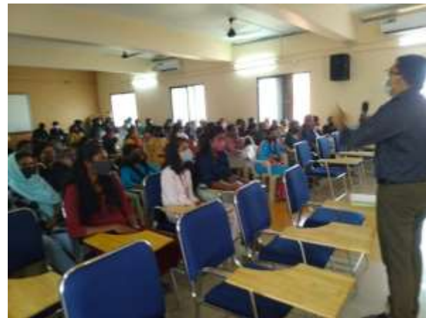
Seminar on Career Goal Redesigning: A Professional Approach

National Forensic Science University • Forensic Science • Forensic Engineering • Forensic Investigation • Forensic IT Security • Forensic Pharmaceutical Chemistry • Forensic Chemistry (Specialization: Forensic Analytical Chemistry) • Forensic Toxicology • Forensic Technology (Forensic Chemistry and Biology)